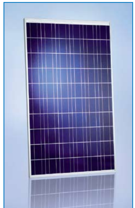
SCHOTT POLY™ 225/220/217/210